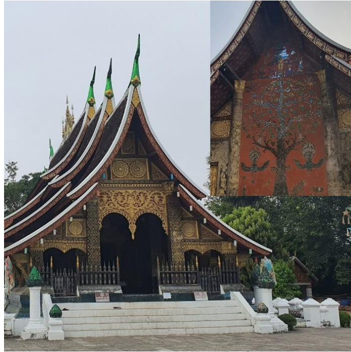
Vat Xieng Thong pagoda in Luang Prabang (Laos)