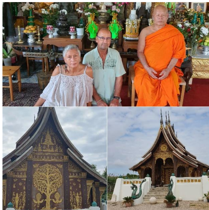
October 2023: Conceptor of the Oui Ensemble project and the President of the association - The head monk of the Vat Xieng Thong pagoda in Montpellier (France)

An exact copy of the Vat Xieng Thong pagoda in Luang Prabang (Laos) was built in Montpellier, complete with tree of life. As “Buddha” predicted climate change with population movements if “Humankind” didn't wake up, last year the Vat's head monk called on the protective spirits to support us.