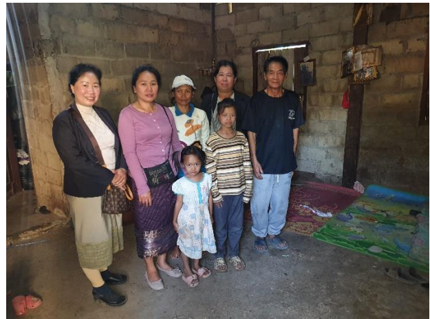
The child living room- Hongkham-Pitsana