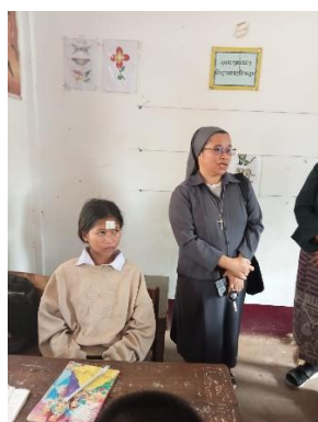
N°5 Chanmy Déc.25