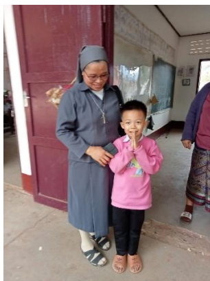
N°3 Detsa Déc.25