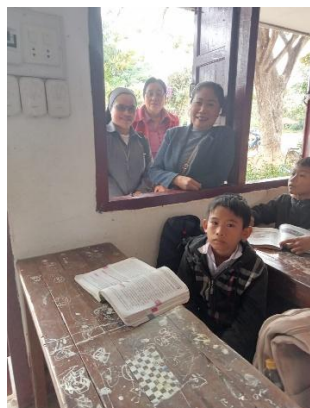
N°2 Bim Déc.25